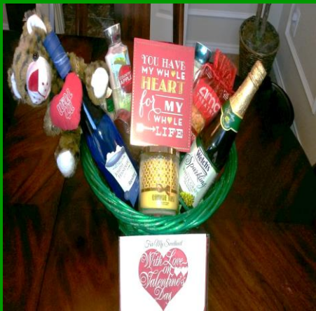
ET FIL Valentine Basket valued over $150

During the month of January 2017, ET FIL held a raffle ticket fundraiser for a Valentine's Day gift basket. ET FIL were successful in their efforts and raised over $500 to be used towards FIL activities. The FIL held the drawing and announcement of the winner via FaceBook Live. ET FIL thank each of their supporters for their donations.