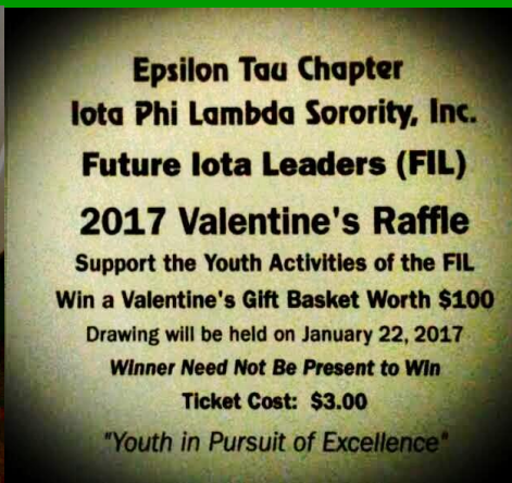
FIL Valentine raffle fundraiser ticket.