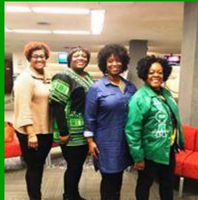
On February 26, 2017, ET Sorors saw 'The Bloodless Jungle' at The Black Academy of Arts and Letters.