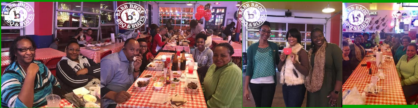
ET Sorors, MOI, FIL, and family enjoy 'A FAMILY AFFAIR' evening with good food, fellowship and music at black-owned Babbs Brothers BBQ in Dallas, TX.

During the month of February Sorors, FIL, MOI, and family members of ET engaged in several activities to celebrate and pay tribute to black history month.