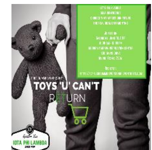
On June 10, 2017, Epsilon Tau's Toys U Can't Return committee presented a workshop on self-confidence and choices at the George Farrow Recreation Center in Irving, TX.