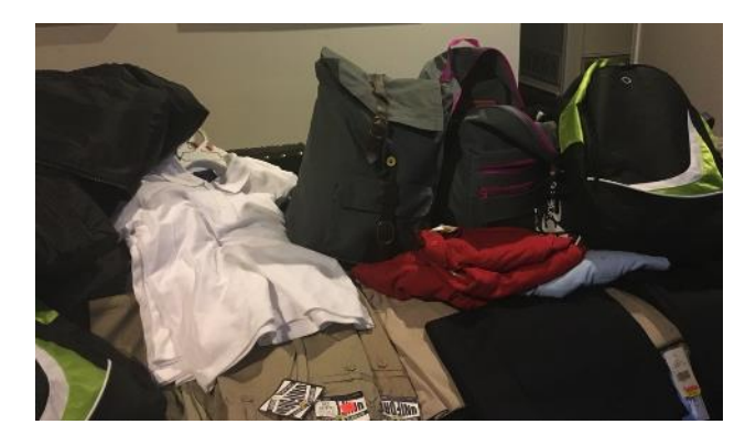
In support of a local family in need of back to school items, Epsilon Tau donated uniforms, backpacks and supplies to five children at the Red Oak Faith Fellowship Church.